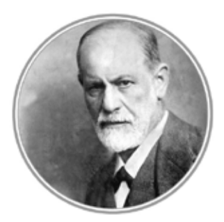
Freud believed that OCD was the patient's maladaptive response to conflicts between unacceptable, unconscious sexual or aggressive id impulses and the demands of conscience and reality. regressing to concerns about control and to modes of thinking characteristic of the anal-sadistic stage of psychosexual development: ambivalence, which produced doubting, magical thinking, and superstitious compulsive acts.

Similar to the treatment recommendations for adults, treatment of OCD in children and adolescents relies on cognitive behavioral therapy (CBT), medication and psychoeducation. Both selective serotonin reuptake inhibitors (SSRIs) and CBT have been systematically studied and empirically shown to be useful in the treatment of children and adolescents with OCD.